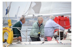
The Jambo! boys will be going head to head with the Afrita team in their very own one-design contest.